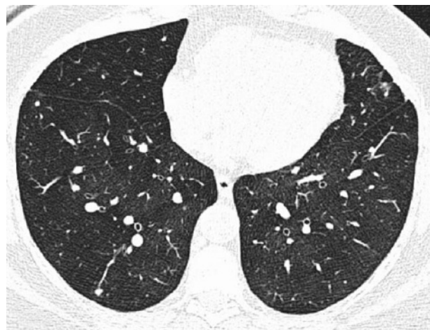
Figure 1 A high-resolution computed tomography scan through the lower lobes shows mosaicism and nodules, a combination of features suggestive of diffuse idiopathic neuroendocrine cell hyperplasia.

disease with a history of previous carcinomas of kidney and breast, had a chest radiograph that showed only multiple nodules. None of the patients in group 2 had bronchial wall thickening. In one patient, follow-up HRCT scans showed new nodules that, due to the rate of growth, were thought to be metastatic carcinoma of the large bowel (the patient died 5 years after presentation).