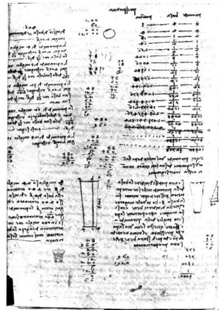
Figure 3 Leonardo da Vinci: examples of mirror writing, mirror numbers and conventional numbers. Arundel MS 263, f 280, verso . Reproduced with permission from the British Library.

Intriguingly, aside from interest in arguably the world’s most famous polymath, Leonardo da Vinci’s writing provides an unusual and unlikely source of information on mirror writing, and probably represents the only known instance of truly habitual mirror writing. 99 100 An example is shown in fig 3. From