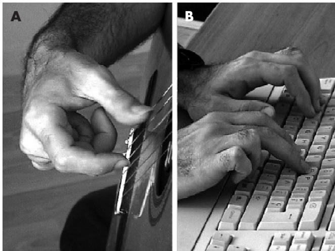
Figure 1 A guitarist showing uncontrolled finger flexion of the middle, ring and little finger while playing the guitar. The ring and the little finger in particular flex uncontrolled (A). One year after the appearance of the first movement abnormalities, similar symptoms appeared during type writing (B). Informed consent was obtained for publication of this figure.

Patients visited our clinical centre 3.4 times on average (range 1–8, SD 1.3) during an average time period of 9.3 months (range 0–33, SD 6.2). A total of 101 out of 771 assessed cases conformed to the diagnosis of focal dystonia; 89 (88.1%) were males. Of the 101 cases, 72 (71.3%) were professional musicians. Sixty-one (61.1%) of the sufferers played only one instrument while 40 (38.9%) played a second instrument.