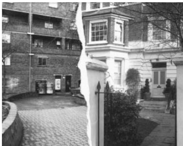
A “feel bad” factor in the health divide?