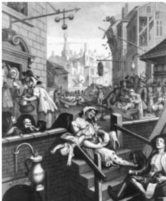
Gin Lane —desperation strengthens the link between poverty and death

ning the social environment and displayed more behavioral depression than dominants.” 30 Loss of social status resulting from being rehoused with more dominant animals was associated with fivefold increases in coronary artery atherosclerosis. 31