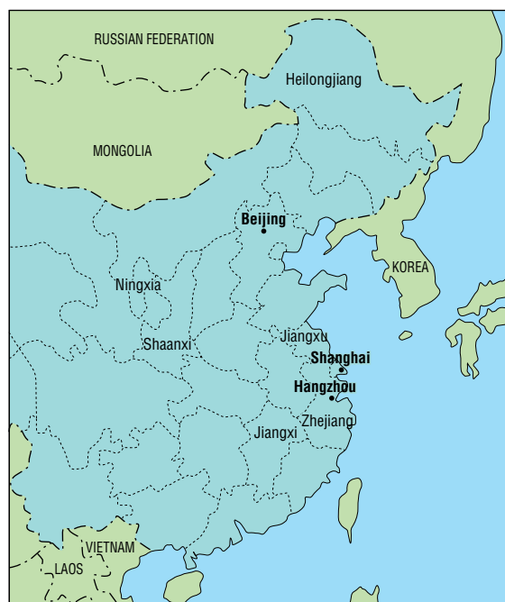
Central China, showing places mentioned in this series

are targeted to the poorest areas. There have been concerns that preventive activities have reduced in some areas because they are less lucrative for health workers than curative care. However, prevention is still high on the political agenda, and spending on this has remained constant in real terms. 1 In fact, the health status indicators of the Chinese population in both rural and urban areas have not worsened since 1981, although there are still marked disparities in health status between the cities and the poor rural areas. Life expectancy has actually improved from 68 years in 1982 to 70 years in 1995. 10