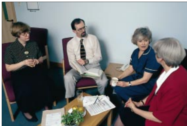
Doctors in teams should assume some collective responsibility for their standards of practice