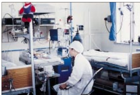
Full neonatal intensive care costs 1000 yuan (£75) a day—almost twice the average monthly income

relatively trivial conditions for insured and rich patients. More worrying than the overuse of proved technology is the existence of much technology which is unproved or obsolete. There is a “myopia correction machine” in a number of hospitals, which even the clinicians doubt is effective. Patients are charged around 100 yuan per treatment.