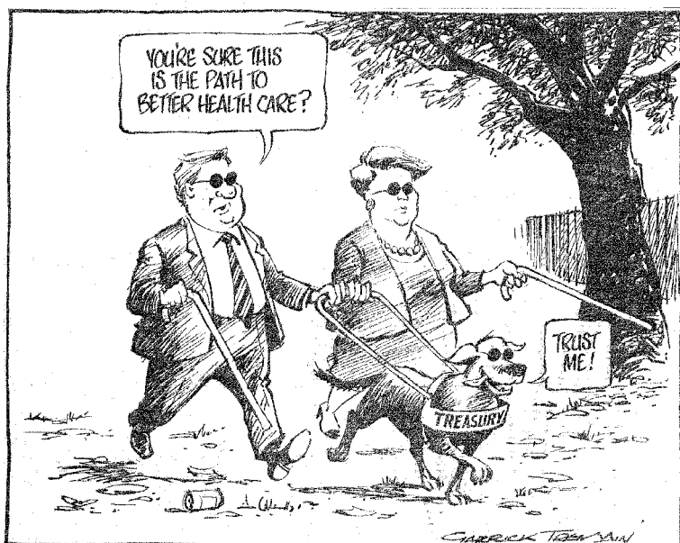
Up the garden path—New Zealand's prime minister expresses qualms to the minister of health about the direction of the health reforms

As in Britain, however, larger groups offer a more powerful peer review process for improving both quality of care as well as accountability for costs. Most associations have established mechanisms for monthly feedback on use of pharmaceutical and laboratory services to contrast the individual members' performance with that of the group. 9 This is an effective mechanism not only in achieving savings but in reducing variation between individual practitioners. 9 To complement this peer review process many associations have