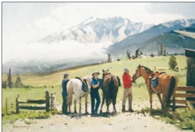
"Muster preparation Coronet Peak near Queenstown" by Peter Beadle. An exhibition of paintings by New Zealand artists is currently showing at Ebury Gallery, London

Key structural elements of the reformed health sector were progressively modified. The Public Health Commission, a centrepiece of the reforms, was disestablished after a productive two years. Contributing factors were the Ministry of Health's antagonism to the commission's independent status and opposition from vested interests including the tobacco industry. The commission's role was taken over by the ministry. The Core Services Committee was also changed. Increasing difficulty in defining core health services to be funded by government led to the restructuring of the committee, now named the National Health Committee. A major focus of its activity became the development of service guidelines. Alternative health-care plans were a further structural casualty. The green and white paper of 1991 had allowed for the possibility that individuals might withdraw funding from the public health system to establish alternative healthcare plans, but this was quietly dropped.