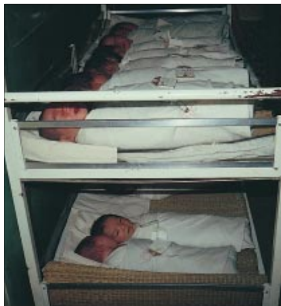
Where there is no rooming in, trolleys are used to bring babies to their mothers for breast feeding

In most cities several hospitals, usually including a specialised women's and children's hospital, provide maternal and child health services. High technology