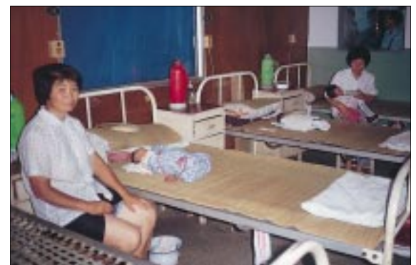
Paediatric ward at a county hospital in Jiangsu province

The overall mortality rates conceal wide variations between urban and poor rural areas. Maternal mortality differs at least fivefold, ranging from 18/100 000 in Shanghai to 108/100 000 in Ningxia. 3 In rural areas the