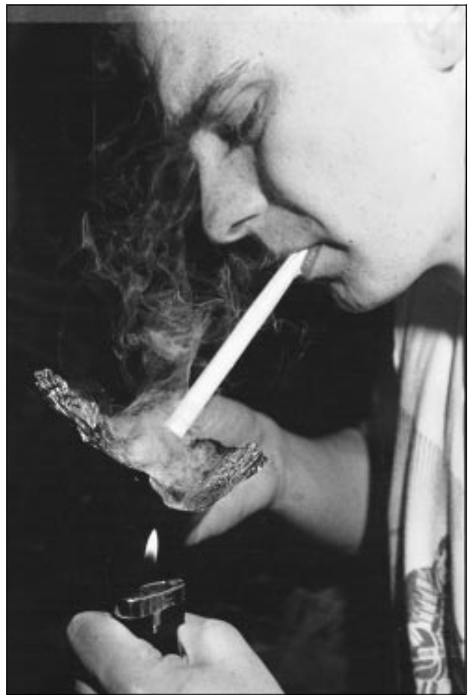
“Chasing the dragon”—smoking heroin (picture reproduced with subject's permission)

The dependence syndrome is a cluster of symptoms, not all of which need be present for a diagnosis of dependence to be made. The key feature is a compulsion to use drugs, which results in overwhelming priority being given to drug-seeking behaviour. Other features are tolerance (need to achieve drug dose to achieve desired effect), withdrawal (both physical and psychological symptoms on stopping use), and use of drug to relieve or avoid withdrawal symptoms. An addict's increasing focus on drug-seeking behaviour leads to progressive loss of other interests, neglect of self care and social relationships, and disregard for harmful consequences.