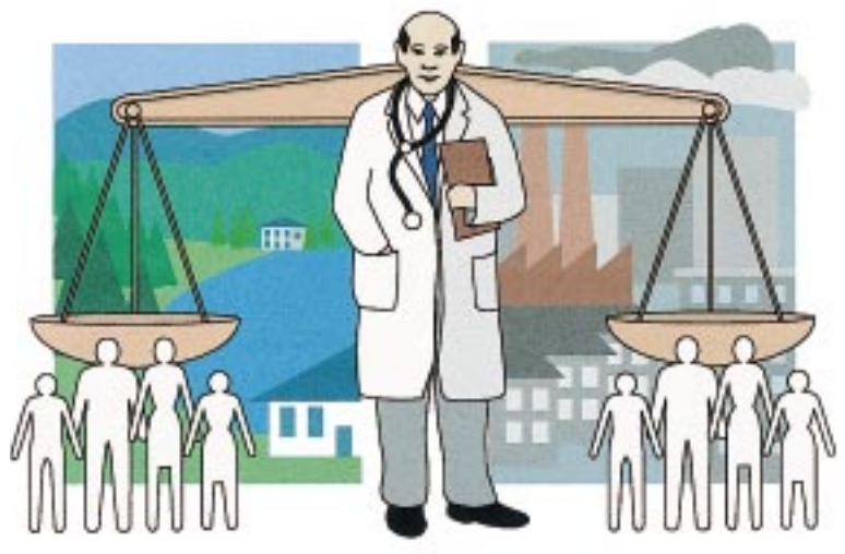
Is a demographic profile of the population adequate for determining health need and therefore resource allocation?

Finding a direct indicator of health status for measuring healthcare need that could be linked to individual use of health care and cost data proved difficult. The model therefore uses various socioeconomic indicators as proxies for healthcare need, over and above that created by the demographic profile of the population. The choice was based on evidence showing that use of hospital services in Sweden was proportional to the relative