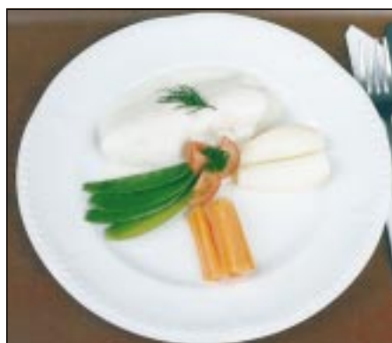
The size and appearance of meals may be as important as their nutritional value. Standard hospital meals (top) are generally unsuitable and should be replaced by smaller, more attractive helpings (bottom)