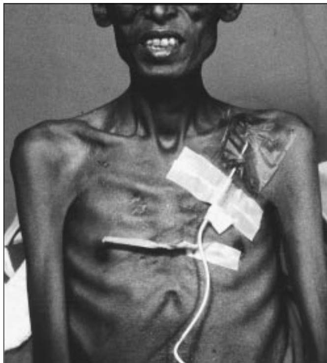
Patient with cachexia

Anorexia is an almost universal component of cachexia. Reduced caloric intake may be more severe in patients with dysphagia due to head and neck pain or oesophageal carcinoma, psychological depression, abnormalities of taste, or chronic nausea. The last is a common symptom in malignant diseases and can be due to autonomic failure, opioids and other drugs, constipation, or bowel obstruction.