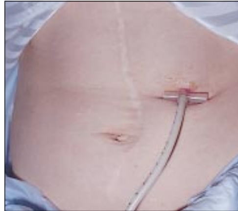
Percutaneous endoscopic gastrostomy