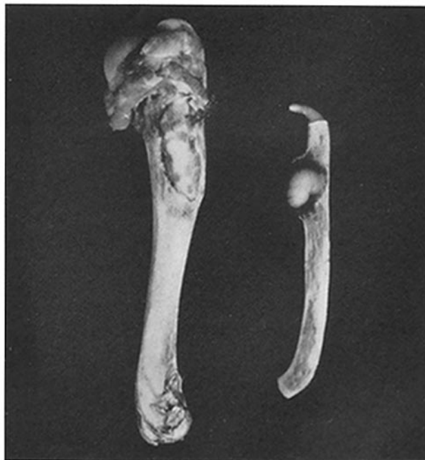
TEXT-FIG. 1. Photograph of bone abscesses after removal of bones from the body and after the soft tissues had been dissected away. The humerus shows an area of bone destruction on its anterior aspect with pus lying in the eroded area; the rib shows an encapsulated collection of pus issuing from its external surface.