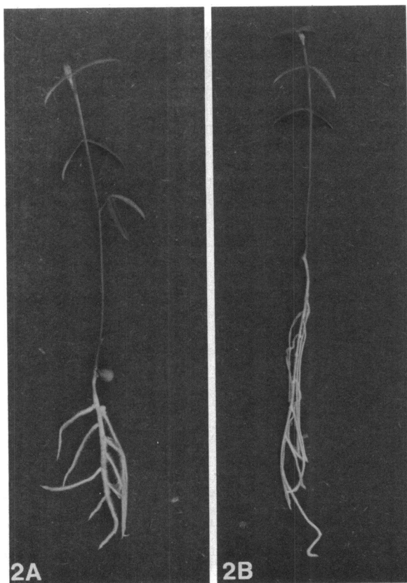
FIG. 2. V. sativa subsp. nigra inoculated with Sym plasmid pRL1JI-harboring strain RBL5601 (A) or Sym plasmid-devoid strain RBL5505 (B). The Tsr phenotype is only observed in Fig. 2A. The phenotype of uninoculated plants (not shown) is similar to that shown in Fig. 2B. The plants were cultured on solid medium as described in Materials and Methods and photographed on day 14.

Root hair phenotypes. To check for possible root hair