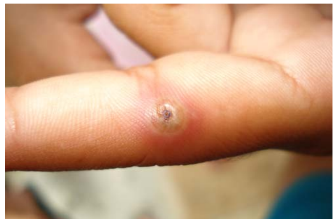
Figure 2. A single tungiasis lesion on the finger of a 7-year-old boy from Brazil, with surrounding erythema. doi:10.1371/journal.pntd.0000087.g002

exclusively from the river; with pigs on the compound, and those usually resting outdoors (Table 1). Other variables significantly associated with infestation included young age (OR = 9.0), low education (OR = 10.0), lack of knowledge on transmission (OR = 7.22), no regular use of footwear (OR = 5.9), no use of soap for bathing (OR = 5.9), and the non-use of commercialized insecticides used as a means of prevention (OR = 9.3).