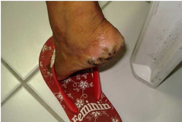
Figure 3. Multiple lesions on the left heel of a 13 year-old Brazilian girl.