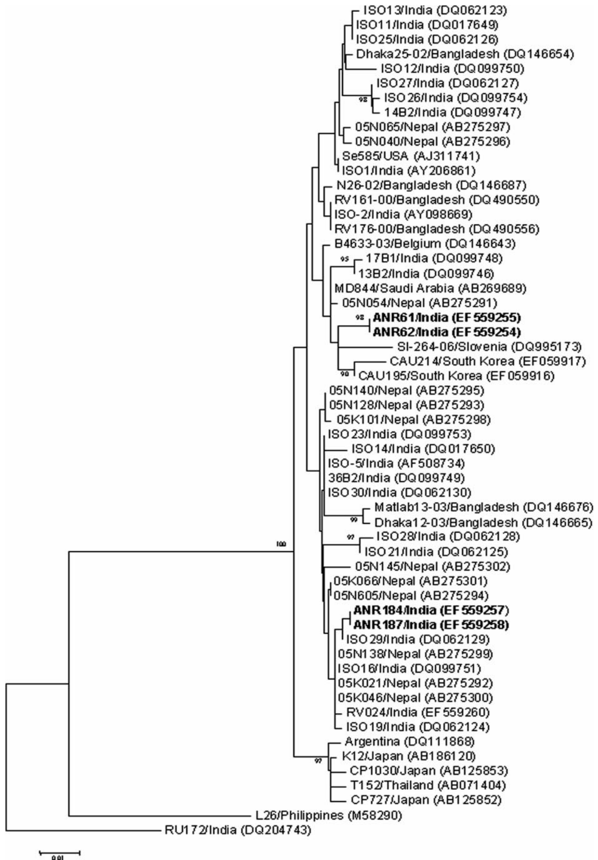
FIG. 2. Neighbor-joining dendrogram of the VP7 gene (nt 68 to 580) of neonatal G12 RV strains from AIIMS (shown in boldface) and other G12 strains. Reference sequences were obtained from the GenBank and EMBL databases; accession numbers are given in parentheses.