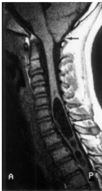
Figure 1 T1 weighted spin echo midsagittal MRI (TR: 404 ms, TE: 15 ms) showing Chiari I malformation with herniated cerebellar tonsils (arrow) and spindle shaped hydrosyringomyelia from C5 to T4 (arrow), with further smaller cavitations to T7 (arrow).

tion as well as two sleeping EEG records and 24 hour EEG records showed normal activity. Due to the unexplained nature of the repeated syncopes, a cerebral MRI was performed. This showed type I Chiari malformation with herniated cerebellar tonsils and compression of the foramen magnum. A subsequent MRI of the spine showed hydrosyringomyelia from C5 to T4, with further smaller cavitations to T7, with no evidence of cavitation above C4. No associated tumour could be found (figure). After consultation with our neurosurgeons we decided against neurosurgical intervention for the time being in view of the completely normal neurological status of the patient. A cerebral and spinal control MRI one and two years later showed no progression of the syrinx.