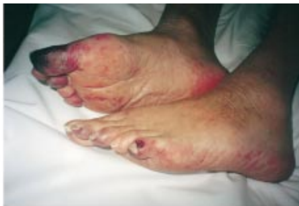
Figure 2 Necrotic lesions of the toes.

A seventy seven year old man underwent arteriography of the supra-aortic vessels for investigation of possible carotid stenosis. Immediately after arteriography the patient developed impaired consciousness and diffuse livedo predominantly in the lower limbs. Simultaneously his blood pressure increased to 230/110 mm Hg.