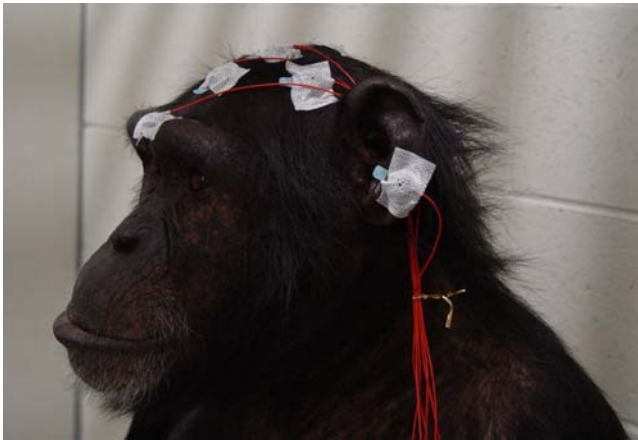
Figure 1. The participant chimpanzee, Mizuki, during ERP measurement.