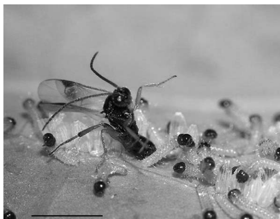
Figure 1. Parasitic wasp ( C. glomerata ) laying eggs in a young caterpillar of P. brassicae . The encounters and subsequent oviposition in suitable hosts are strong reward stimuli in learning of parasitic wasps. Bar = 3 mm.

In experiment 1a (figure 2a,b), we tested for C. glomerata whether conditioning (four levels: naive, single trial, three massed trials and three spaced trials), and inhibitor treatment (two levels: sucrose and sucrose + ACD) had an effect on the response level to the nasturtium plant (GLM: conditioning: \chi^2_3 = 15.01 , p < 0.0018 ; treatment: \chi^2_1 = 26.79 , p < 0.0001 ; conditioning \times treatment: \chi^2_3 = 20.36 , p < 0.0001 ) For C. rubecula (figure 2b), we tested whether conditioning