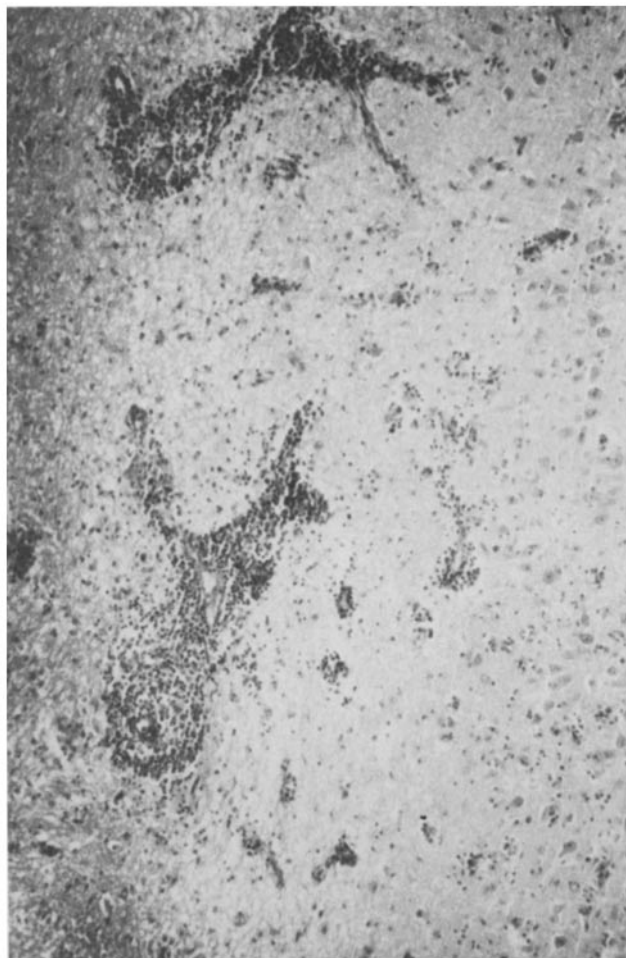
FIGURE 3. Inflammatory lesions in the hippocampus of immunosuppressed, BDV-infected rats, 5 d after transfer of 8 \times 10^6 virus-specific CD4 + T cells, with predominant mononuclear perivascular infiltrations extending into the surrounding neuropil (hematoxylin and eosin, \times 160 ).

These data provide direct evidence that MHC class II-restricted BD virus-specific cells with the T helper/inducer phenotype represent the T cell subset relevant to the immunopathological reaction. Since classical cytotoxic CD8 + cells have never been detected in BD virus-infected animals (our unpublished results), the pathogenesis of BD differs from that of lymphocytic choriomeningitis (LCM), which represented for a long time the paradigm for a virus-induced immunopathological reaction. In LCM class I-restricted, virus-specific CD8 + cells are the only cell population found to be essential for the immunopathological event leading to the fatal disease (11). Furthermore, in contrast to MBP-specific CD4 + T cells found in experimental autoimmune encephalomyelitis (12) cellular infiltrates were found predominantly in the grey matter after transfer of the BD virus-specific CD4 + T cells. Thus, BD is likely to be a unique virus-induced immunopathological disorder affecting the CNS. Additionally, BD lends itself exquisitely to investigate the course and consequence of a virus infection of the CNS, where intensive contact with the immune system is greatly avoided by strategies of replication and spread of the virus exclusively in neu-