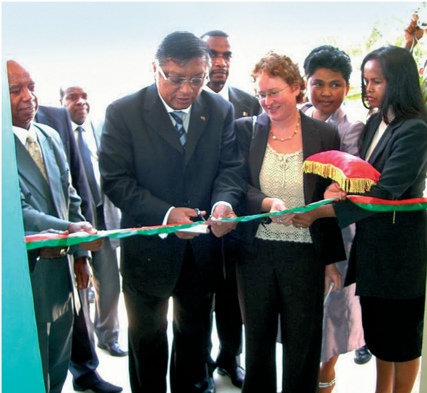
The minister of health inaugurates the National Centre for Refraction and Low Vision training on World Sight Day, 11 October 2007. MADAGASCAR

Approximately 90% of visually impaired children in low-income countries do not go to school, and in most countries there are more boys than girls in schools for the blind. Some of the factors which prevent visually impaired children from attending school are: lack of infrastructure, suitable educational materials, or qualified teachers, as well as distance between home and school and lack of awareness on the part of parents. In addition, the lack of provision for children with low vision or refractive errors may also reduce school attendance and academic performance.