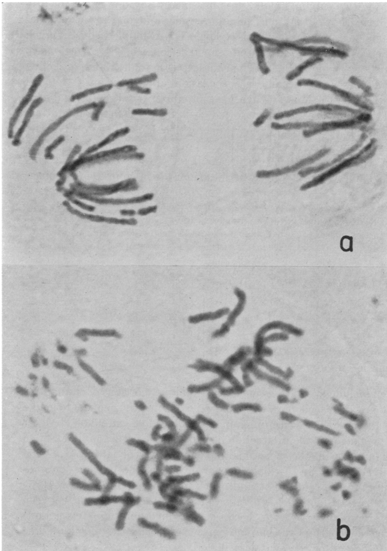
FIG. 2.—(a) Anaphase of Vicia faba showing gaps and breakage 4 hours after immersion in 10^{-6} M FUDR. (b) Anaphase from a root treated 6 hours in a solution of 10^{-6} M FUDR.

At a concentration of 10^{-7} M FUDR, essentially no breaks appeared in cells that reached division during the first 6 hours in spite of the fact that this concentration during the same period results in a marked drop in mitotic index. On the other hand, 10^{-6} M FUDR produced nearly a maximum effect on fragmentation. Higher concentrations, 10^{-5} or 10^{-4} M, produced a quicker effect on the mitotic