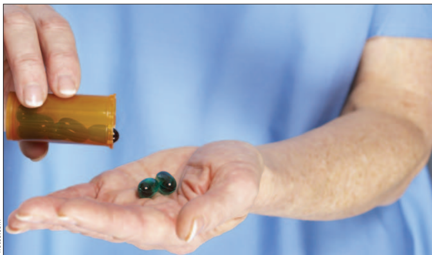
Just 4 of Canada’s 17 medical schools have a required course in clinical pharmacology.

As a bare minimum, trainees should understand how drugs work,