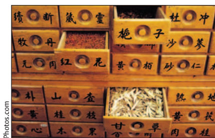
Traditional Chinese medicine is based on various belief systems.

He motioned me forward. The translator ordered me to extend my hand, palm up, on a soiled pink satin cushion. My pulse was taken, my tongue scrutinized. A asked my age and gravely inquired about my current medications. A look of disapproval crossed