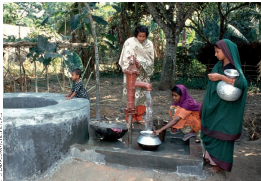
Fig 1 | Although installation of wells in Bangladesh has reduced diarrhoeal disease, contamination with naturally occurring arsenic jeopardises the safety of both drinking water and food. This hand pump has been painted red to show contamination, (clean wells are painted green)

The health effects of global environmental change will vary between countries. Loss of healthy life years in low income African countries, for example, is predicted to be 500 times that in Europe. The fourth assessment report of the Intergovernmental Panel on Climate Change concluded that adverse health effects are much more likely in low income countries and vulnerable subpopulations. These disparities may well increase in coming decades,