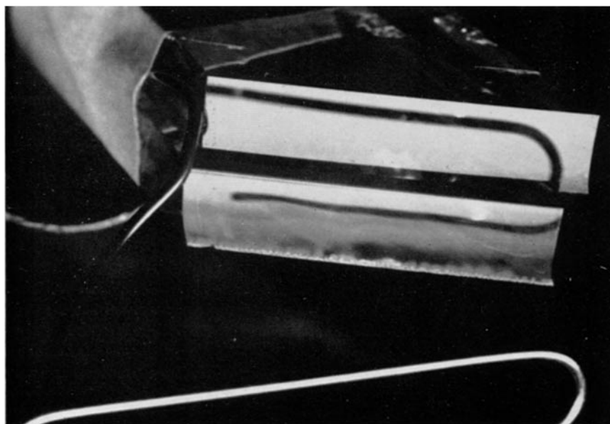
TEXT-FIG. 2. Reflection of a paper clip on the clearance facet of a glass knife made as described (upper) and made by the usual method (lower). The knife edges are at the right.

Pieces of clean \frac{1}{4} inch plate glass about 8 by 5 inches are selected (Text-fig. 1). The surface is scored with a glass cutter for about \frac{1}{4} inch at A . The tip of the cutter handle is placed under A as a fulcrum and the corners B , C pressed firmly with the palm of each hand. With practice the glass will break in a slight curve from A to D . This break is then inspected by observing on it the re-