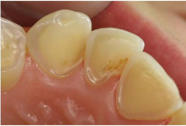
Fig. 3 Erosion with involvement of dentine on the oral surface of tooth 13, 12 and 11. Intact enamel borders along the gingival margin