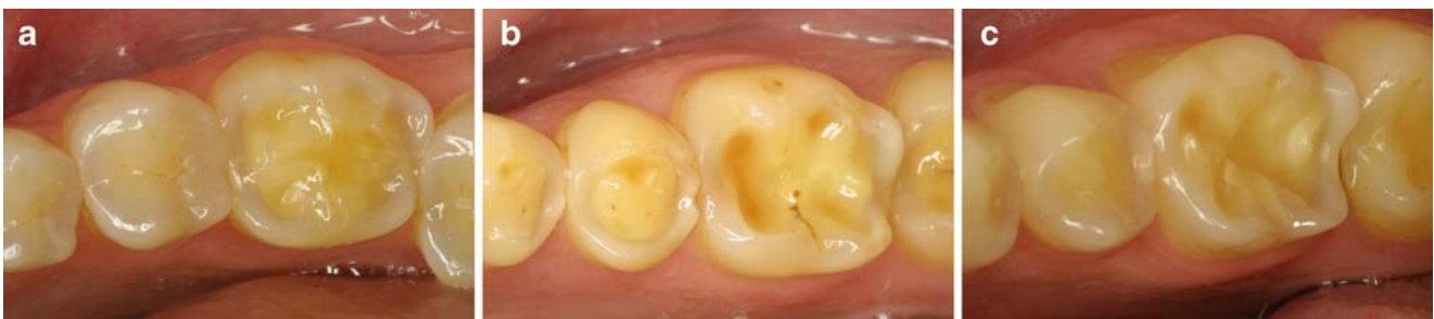
Fig. 4 a–c Typical pattern of advanced occlusal erosion of teeth 45 and 46 of three different patients: The whole occlusal morphology disappears, and extensive exposed dentinal areas are visible

Acids such as citric acid exist in water as a mixture of hydrogen ions, acid anions (e.g. citrate) and undissociated acid molecules, with the amounts of each determined by the acid-dissociation constant and the pH of the solution. The hydrogen ion directly attacks the crystal surface. Over and above the effect of the hydrogen ion, the citrate anion may complex with calcium, also removing it from the crystal surface. Each acid anion has a different strength of calcium complexation dependent on the structure of the molecule and how easily it can attract the calcium ion [28]. Consequently, acids such as citric acids have double actions