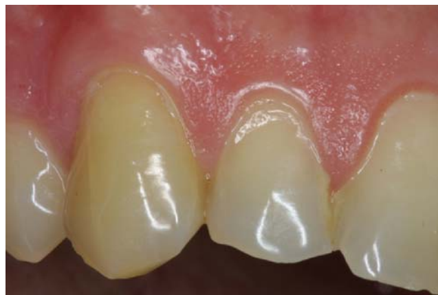
Fig. 1 Facial erosion: The intact enamel border along the gingival margin of tooth 12 and some plaque remnants are clearly visible. Note the smooth silky-glazed appearance and the absence of perikymata on the enamel surface

The clinical examination should be done systematically using a simple but accurate index. This is a difficult task to achieve as an index with a too-fine grading shows a small inter- and intraexaminer reliability [60]. For a dental practitioner, the most important part is to recognize the condition and to describe its dimension and severity. It is important to search for a general pattern and not to overinterpret one single sign. For epidemiological purpose, an