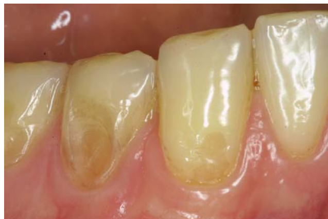
Fig. 2 Advanced facial erosion of teeth 43, 44 and 45 with dentinal involvement. The width of the lesions exceeds its depth

It is difficult to judge the activity and progression of dental erosion. One tool is the comparison of clinical photographs of tooth surfaces to estimate the possible substance loss over time. Thereby, the discoloration of the lesions and their sensitivity state may give some information about the activity of the tooth surface. Further, study casts as well as the examination of dental radiography, especially bitewings longitudinally taken, can provide information about the substance loss over time. For research purpose, computed controlled mapping [13] or profilometric measurements using acid-resistant markers [6, 92] are tools to monitor progression.