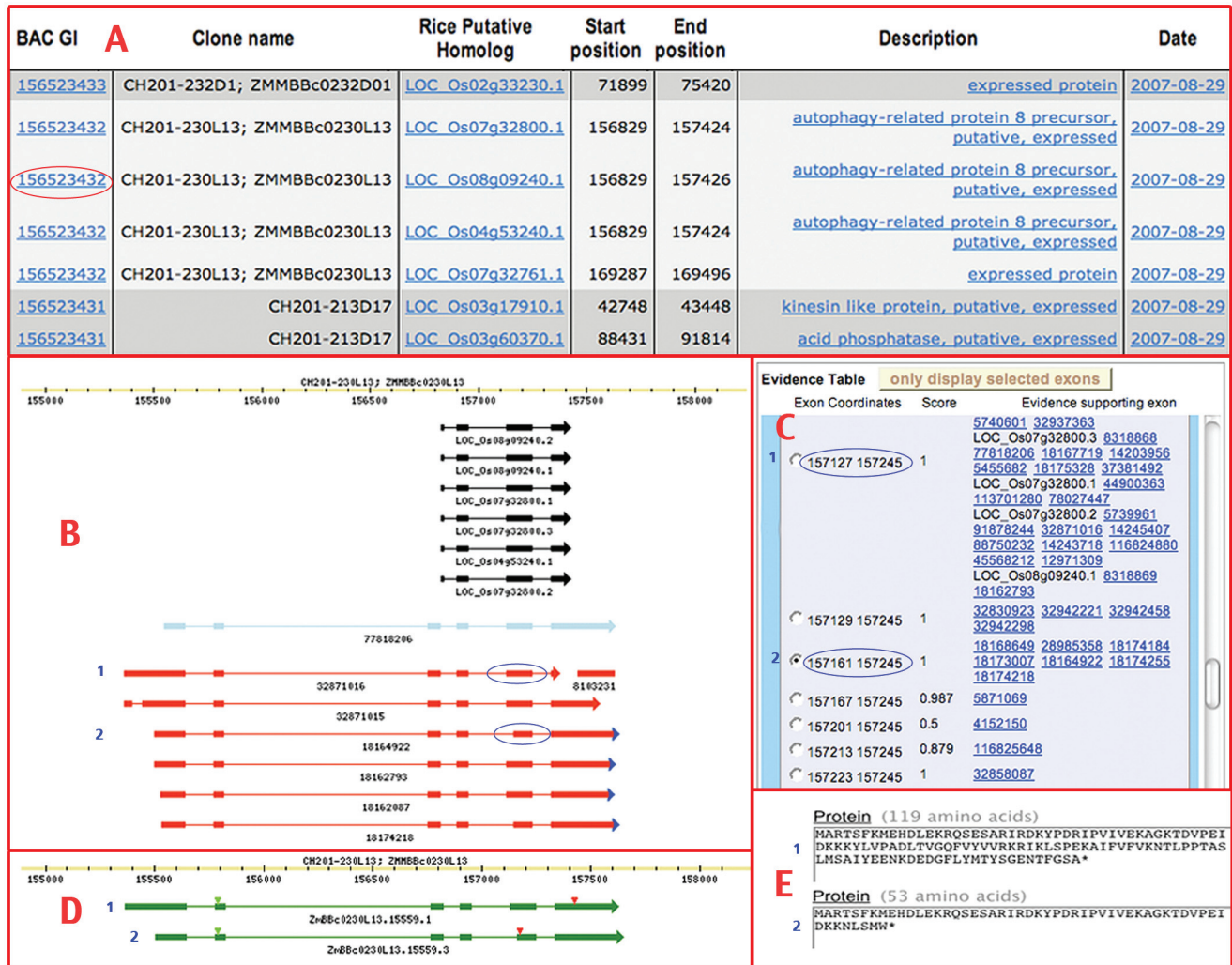
Figure 3. Screenshots from ZmGDB and yrGATE illustrate the use of online tools for gene discovery and community gene annotation. (A) A web-accessible table of Z. mays BACs (alternately shaded) displaying (left to right) the BAC GI, BAC clone name, followed by the ID, start/end coordinates and functional annotation of splice-aligned TIGR-predicted proteins from O. sativa and finally the ZmGDB entry date. All fields are searchable and each row is linked via column 1 to a genome browser view of the BAC region. This table is currently updated daily at ZmGDB ( http://www.plantgdb.org/ZmGDB/DisplayGeneAnn.php ). (Similar tables are available for eight other BAC-based xGDB browsers.) Note that a region of BAC GI 156523432 is aligned to three paralogous rice predicted polypeptides, annotated as ‘autophagy-related protein 8 precursor’. Clicking on the BAC GI ‘156523432’ in table column 1 (circled) brings up a BAC/Clone Context View of the specified region (B), showing spliced alignments to the rice predicted polypeptides (black), along with other alignment data, in this case maize cDNAs (blue) and maize ESTs (red). Note the evidence for alternative splicing among the maize ESTs (circles) suggesting at least two alternate transcripts (labeled 1 and 2). The user has the option to explore and annotate this variation using yrGATE. (C) Launching the yrGATE annotation tool displays scrolling list of evidence scores and supporting exons for all exon coordinates at a locus (alternative splice coordinates for 1 and 2 are circled). The user can build a complete gene model on screen by selecting each desired exon and then compare the resulting open reading frame to known proteins using BLAST (data not shown). (D) The chosen gene model is displayed graphically and will be published on the ZmGDB browser following curation by PlantGDB staff. Shown here are yrGATE models for the two putative splice variants, with translation start/stop positions indicated by triangles. (E) Predicted protein sequence for the two yrGATE gene models. This example illustrates how xGDB and yrGATE can be used to identify and publish gene model predictions quickly and easily, enhancing the community genome knowledge base for maize as well as facilitating hypothesis-driven research.

providing a powerful and timely gene discovery tool for researchers (Figure 3). This effort represents an early implementation of a real-time, high-throughput, discovery-oriented annotation process using automated workflows.