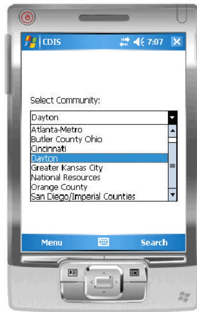
Figure 9. CDIS on a PDA (selecting a community for downloading).