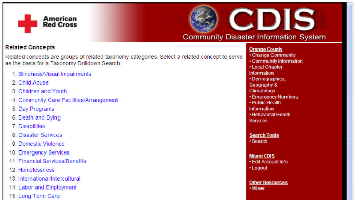
Figure 6. Related categories provides another view of the taxonomy.