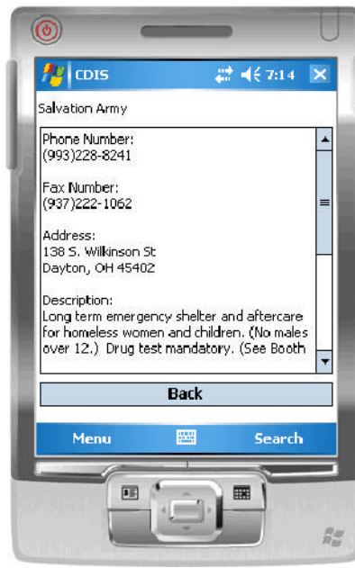
Figure 10. Resource Information