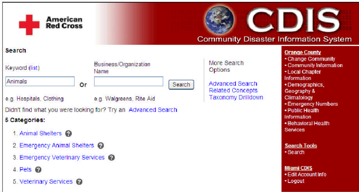
Figure 2. Example of the CDIS interface for category keyword searching.