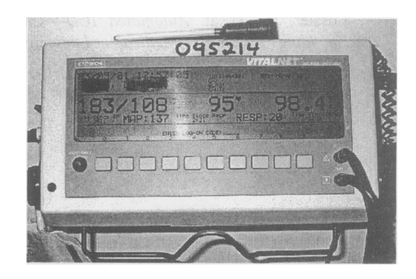
Figure 1 – VitalNet Bedside Unit

Since 1989 we have had an almost perfect solution to the bedside data-capture problem. (See Figure 1). The solution came from a commercial vendor, Critikon, that provided automated entry of the blood pressure, pulse and temperature measurements. It also provided for bedside capture of other measures by keypad. The bedside device includes an automated BP machine (based on oscillometry), a temperature probe, ten keys in a linear layout and 2.5 X 9 inch LCD screen. The meaning of the keys is programmable and labeled by words on the LCD above the keys. These keys can also be used for data entry. The bedside unit displays the automated measurements when they are captured but requires the operator to confirm before they are transmitted for storage to a dedicated ward computer. The ward computer provides a number of printed reports, including a graphical temperature chart that can be placed on the bedside clipboard. The ward computer