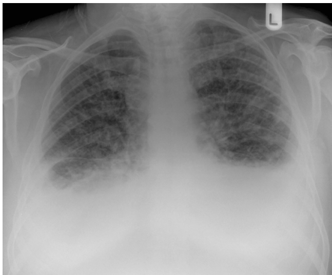
Figure 1 Chest X-ray: bilateral pleural effusions and extensive interstitial reticulo-nodular shadowing.

Appearances were those of a renal cell carcinoma (Clinical TNM Stage T3N2M1) with lymphangitis carcinomatosa as part of extensive lymphatic spread. The initial needle biopsy of the cervical lymphadenopathy was inconclusive but a further excision biopsy confirmed the diagnosis of metastatic renal cell carcinoma. Oral steroids and analge-