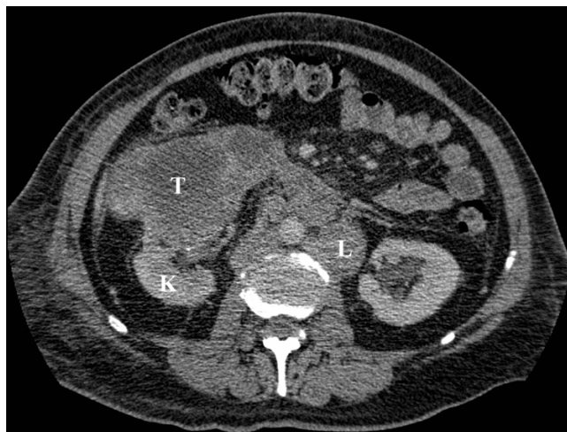
Figure 3 Axial CT through the mid-abdomen following intravenous contrast: the normal part of the right kidney (K) is seen posteriorly with a large mass containing central necrosis arising anteriorly (T). Enlarged lymph nodes (L) are also seen adjacent to the aorta.