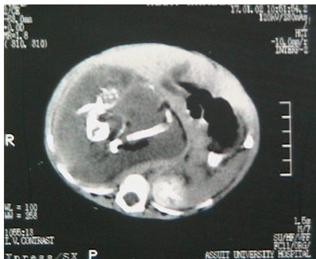
Figure 2 Computed Tomography scan of the patient's abdomen reveals a large retroperitoneal soft tissue mass. There are long hyperdense opacities that resemble fetal bones (see arrows)