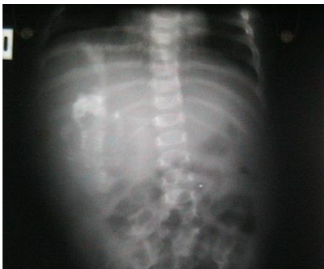
Figure 1 Anteroposterior abdominal radiograph demonstrates a soft tissue mass in the right hemiabdomen. The mass contains calcified osseous-appearing structures of varying sizes and shapes (see arrows)

After four years our patient has shown no recurrence or complications and is leading a completely normal healthy life.