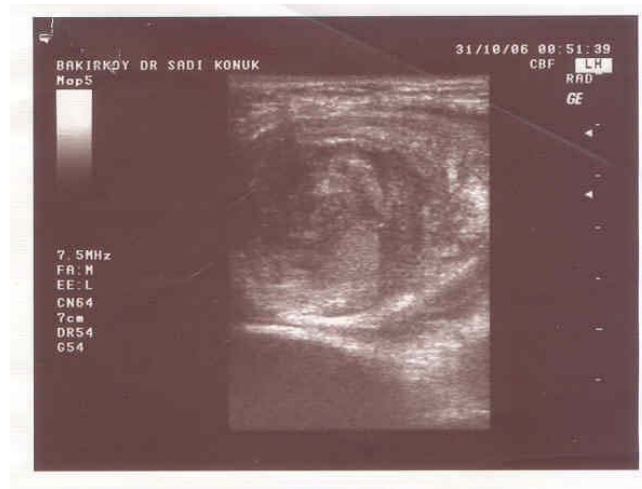
Figure 2 US appearance misdiagnosed as intestinal obstruction "Target sign".