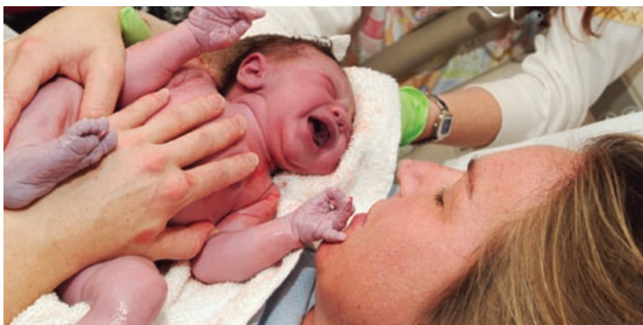
Maternity services are lucky to have a dedicated workforce but staff could work in a less burdensome way

“Maternity services are fortunate to have a dedicated workforce, but I believe they