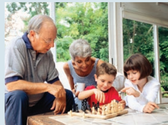
Cognitive decline fell by almost a third in nine years

The 2002 cohort had significantly more education and higher net worth than the 1993 cohort. In the 1993 group