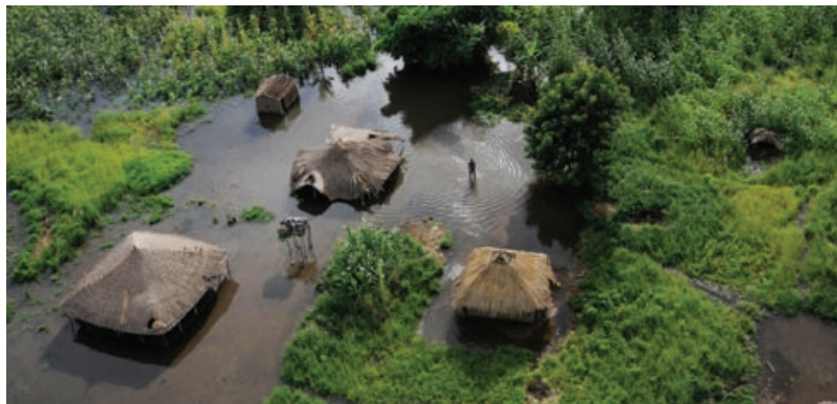
Submerged homes on the banks of the Zambezi River in central Mozambique

Many families have been split in the chaos of the flooding.