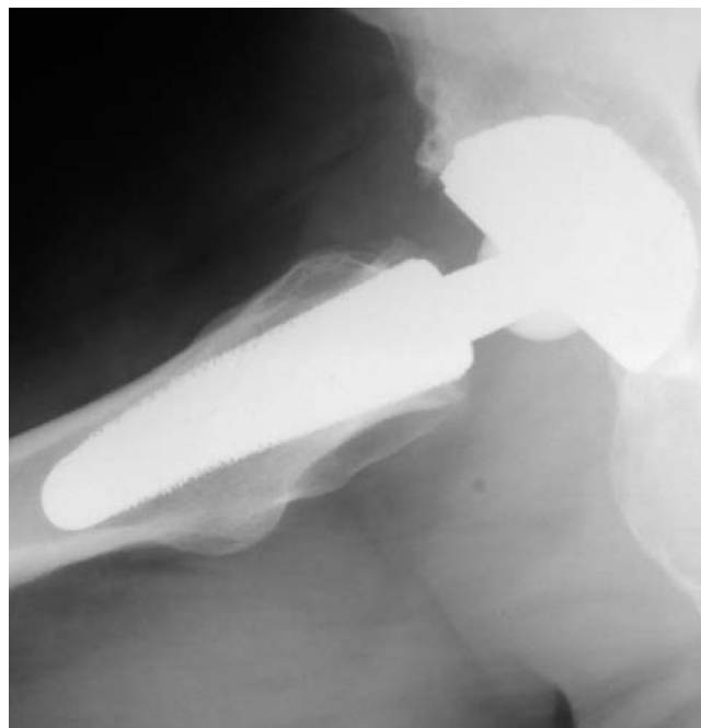
Figure 3 sagittal radiograph of the Cut prosthesis. Figure 2 is showing the anteroposterior, figure 3 is showing the sagittal radiograph 12 months after implantation of the implant in a 50 year old male patient.

ments, as requested by Cohen and Rushton [13] and Martini and co-workers [14,15]. Densitometric measurements of the non-operated side were performed on each measurement of the operated hip. These ruled out a possible systemic bone density loss in all of the 20 cases. A software designed for the measurement of bone mineral density adjacent to metal implants was used (Norland DxA Version 3.9.4) on a Norland PC (NPC-200). Seven regions of interest were determined after modification of the classification of Gruen and co-workers to the specific dimensions of the femoral implant [16] (Fig. 4). Because of the relatively small dimensions of the implant, and the congruously small zones compared to conventional prosthesis, the lateral zones 1, 2 and 3 were later combined to a lateral value (ROI lat ) and the zones 5, 6, and 7 combined to a medial ROI med . Bone mineral density around the whole implant was also calculated (ROI all ). Periprosthetic bone mineral density (BMD) was measured longitudinally at the three postoperative follow-ups. At each measurement, the change in BMD was compared with the baseline 10 days after surgery and calculated as the BMD