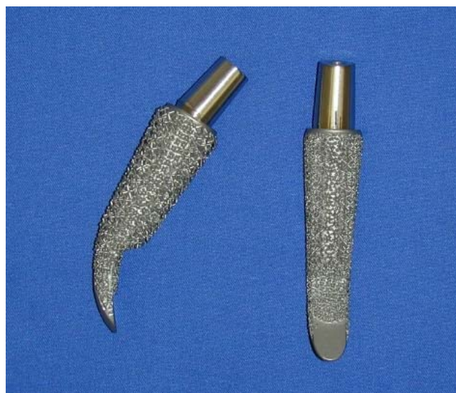
Figure 1 Cut 2000 femoral neck prosthesis. The short femoral neck implant used in the study, pictured from the side (left) and from the front (right).

recorded. Both are disease specific tests used frequently in the assessment of total hip replacement [9]. The Harris Hip Score is a classical, staff administered test with domains for pain, function, deformity and motion adding up to a maximum of 100 points. According to Harris[10], following THR a postoperative score of 90–100 points is considered a very good result, while a scores between 80–90 points are good. A score between 70–80 is considered fair, and a score below 70 regarded as bad postoperative outcome. The Western Ontario and McMaster Universities Osteoarthritis Index (WOMAC) is a self-administered questionnaire with three subscales measuring pain, stiffness and physical function. A global score may be extracted from the three subscores on a 0 to 10 scale, best to worse. At a three year follow-up of hybrid and cemented total hip replacements, Nilsson et al. [11] reported a mean global WOMAC score of 1,8 for the first, and 2,4 for the second group. For this study, the WOMAC's German version was used, which has been shown to be a valid and reliable instrument to assess symptoms and physical function disability in patients with hip osteoarthritis [12].