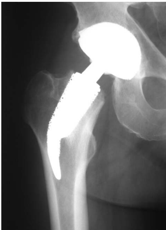
Figure 2 ap radiograph of the Cut prosthesis.

ments, as requested by Cohen and Rushton [13] and Martini and co-workers [14,15]. Densitometric measurements of the non-operated side were performed on each measurement of the operated hip. These ruled out a possible systemic bone density loss in all of the 20 cases. A software designed for the measurement of bone mineral density adjacent to metal implants was used (Norland DxA Version 3.9.4) on a Norland PC (NPC-200). Seven regions of interest were determined after modification of the classification of Gruen and co-workers to the specific dimensions of the femoral implant [16] (Fig. 4). Because of the relatively small dimensions of the implant, and the congruously small zones compared to conventional prosthesis, the lateral zones 1, 2 and 3 were later combined to a lateral value (ROI lat ) and the zones 5, 6, and 7 combined to a medial ROI med . Bone mineral density around the whole implant was also calculated (ROI all ). Periprosthetic bone mineral density (BMD) was measured longitudinally at the three postoperative follow-ups. At each measurement, the change in BMD was compared with the baseline 10 days after surgery and calculated as the BMD