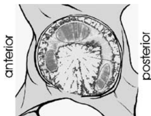
Fig. 1 Most of the load is transferred at these three distinct areas, where the acetabular bone is supported by the iliac, pubic and ischial bone (three-spot support, left acetabulum)

There are numerous papers covering the recommendations on how the components should be positioned in total hip arthroplasty. Lewinnek introduced the safe zone concept in 1978 [10]. He derived his recommendations from clinical findings: cup orientation from 5^{\circ} to 25^{\circ} of anteversion and 30^{\circ} to 50^{\circ} of abduction showed a lower rate of dislocation. Nothing is said about the stem orientation. Apparently, the cup and neck should be oriented relative to each other, accordingly, in order to prevent cup-to-neck impingement. This is expressed by the so-called “combined version” for the cup and stem.