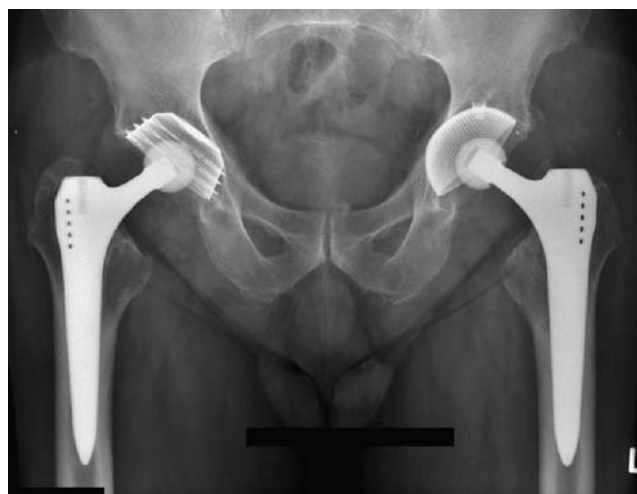
Fig. 2 Seating the cup beyond the cortical rim of the acetabulum will put its osseointegration at risk. Cortical rim contact of the cup is necessary for primary stability and secure osseointegration

Ranawat recommends different combined versions for men and women [11], while computer simulation with three-dimensional models revealed that the size of the safe zone is optimised when the “intended range of motion” concept is introduced. This concept tells the surgeon which component orientation he/she should adhere to when a predefined range of motion should be reached by the patient [12]. There is a linear correlation between cup anteversion and stem antetorsion [12], and also between cup abduction and the neck-to-shaft angle of straight stems [8]. The optimal range for the neck-to-shaft angle is between 125^{\circ} and 130^{\circ} . These stems allow the lowest cup abductions, which is beneficial for a small edge loading and for a reduced risk of dislocation. In addition, it is close to the CCD angles found in the normal femur [13–15].