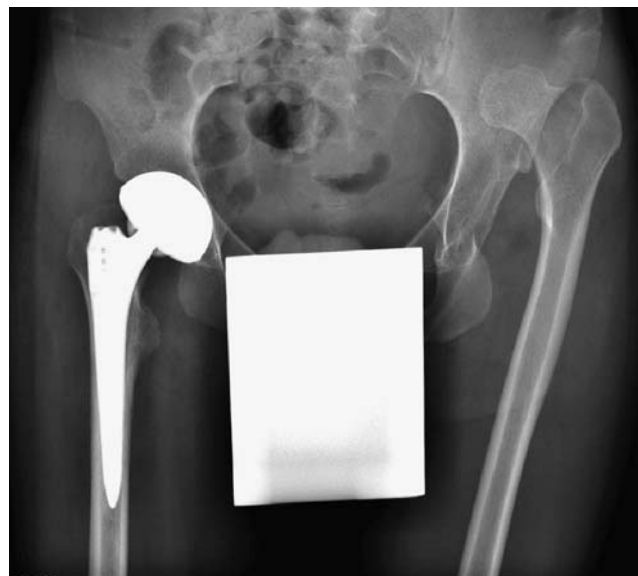
Fig. 5 Secure fixation is achieved by precise reaming of the acetabular bone, even in dysplastic pelvises. Hip biomechanics is restored on the right side after distraction (distance=8.5 cm)

What is the role of computer-assisted surgery in total hip arthroplasty, in particular, computer navigation? Above all, computer navigation software should have a built-in database that illustrates the safe zone for each prosthesis system considering its specific design and implantation parameters. Based on this built-in knowledge, such a navigation system converts from a simple three-dimensional measuring system to a real navigation tool that supports the surgeon in finding the best way of component orientation, especially in setting the complementary orientation of the cup or the femoral stem when the orientation