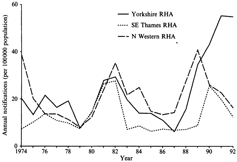
Fig. 2. Annual notifications of infective jaundice per 100000 population in three NHS Regions of England 1974-92 (1992 totals are provisional).