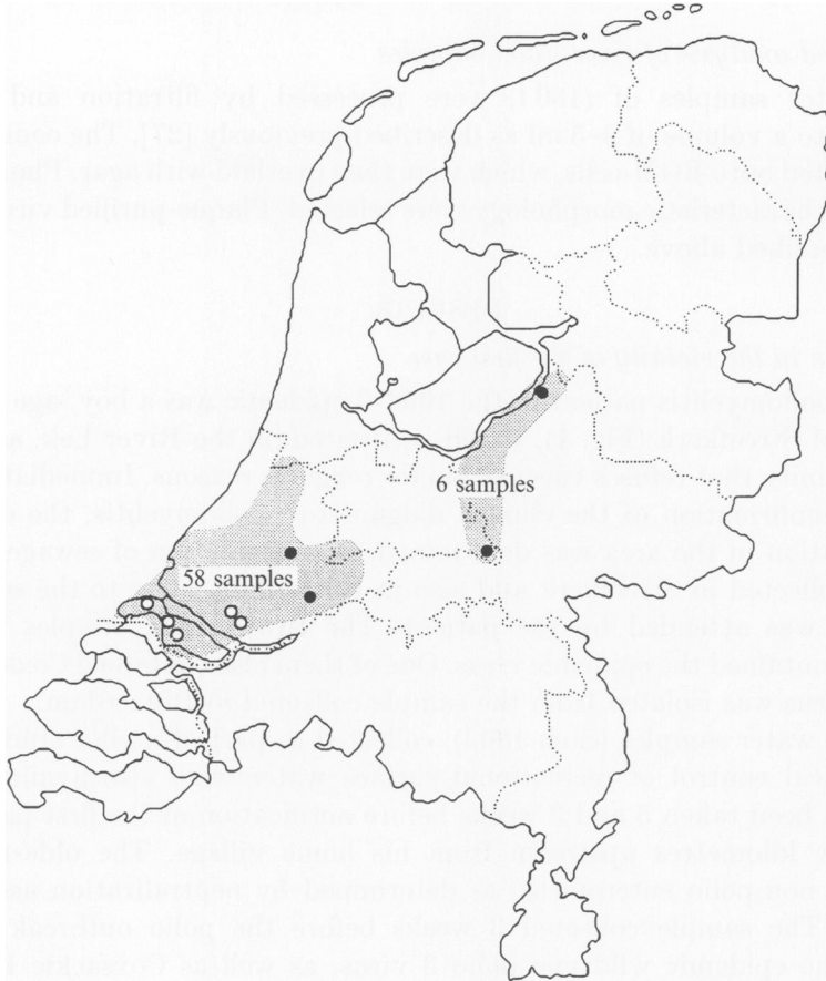
Fig. 2. Regions in which sewage samples were collected during week 2 of the 1992-3 poliomyelitis epidemic (shaded). Locations where wild type 3 poliovirus (●), or Sabin vaccine virus (○) was found.

sample taken from the region in the vicinity of the first case (Table 1). Seven samples contained Sabin vaccine virus, mainly type 2.