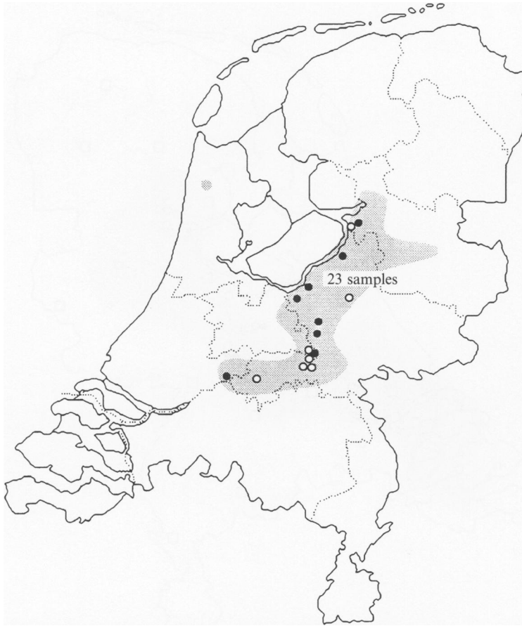
Fig. 3. Regions in which sewage samples were collected during week 4 of the 1992/3 poliomyelitis epidemic (shaded). Locations where wild type 3 poliovirus (●), or Sabin vaccine virus (○) was found.

number of wildtype poliovirus-positive samples at several locations coincides with the number of polio patients from these regions at the time the samples were taken. The last sample, that still contained the wildtype polio 3 virus was collected in the last week (week 24) of the epidemic.