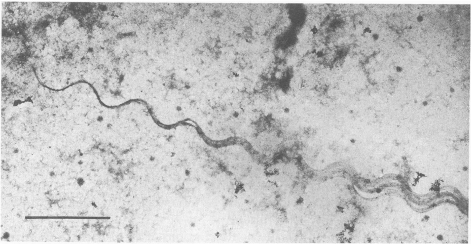
Fig. 2. Transmission electron micrograph of detail of spirochaete-like object showing fibre-like composition. Bar = 5 \mu\text{m} .

DNA from the SLOs, when amplified by PCR using the primer pairs osp2/osp4 , fla1/fla3 and DD02/DD03 yielded no products that could be reproducibly attributed to B. burgdorferi . PCR using the eubacterial specific primers pA and pE successfully amplified a 950 bp fragment in 92 of 92 SLO cultures, however the fragments amplified produced characteristic enzyme digestion products of a Bacillus sp. and not a Borrelia sp.