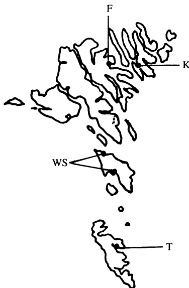
Fig. 1. Map of the Faroe Islands, showing the locations of the four areas selected for the study. K, Klaksvík; WS, Western Sandoy; T, Tvøroyri; F, Fuglafjørður.