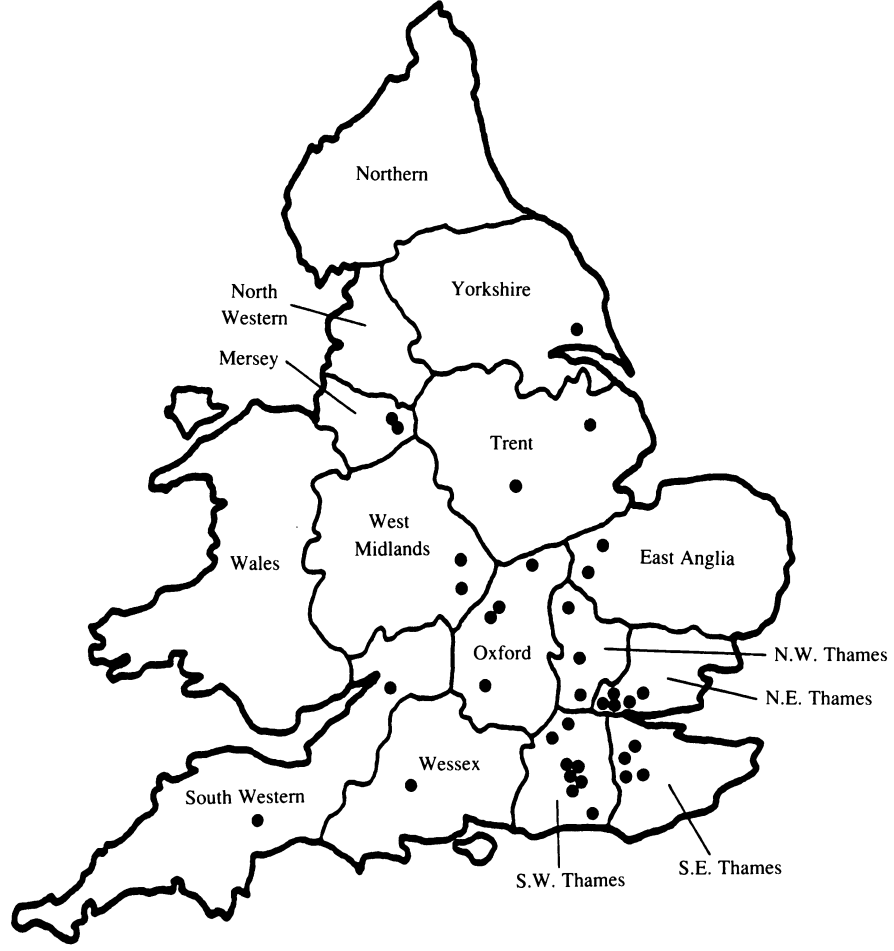
Fig. 1. Location of 36 outbreaks of food poisoning related to Stilton cheese consumption within regional health authority districts.