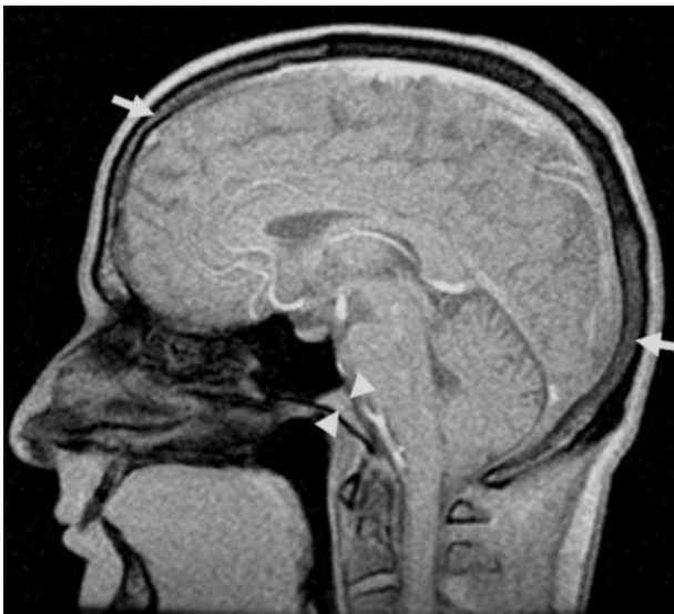
Fig 1. Clival (central arrowheads) and calvarial (outer arrows) marrow were systematically identified on the axial MR images by using the sagittal localization as a reference.

Note: —MSK indicates Memorial Sloan Kettering rating scale. *Protease inhibitor.