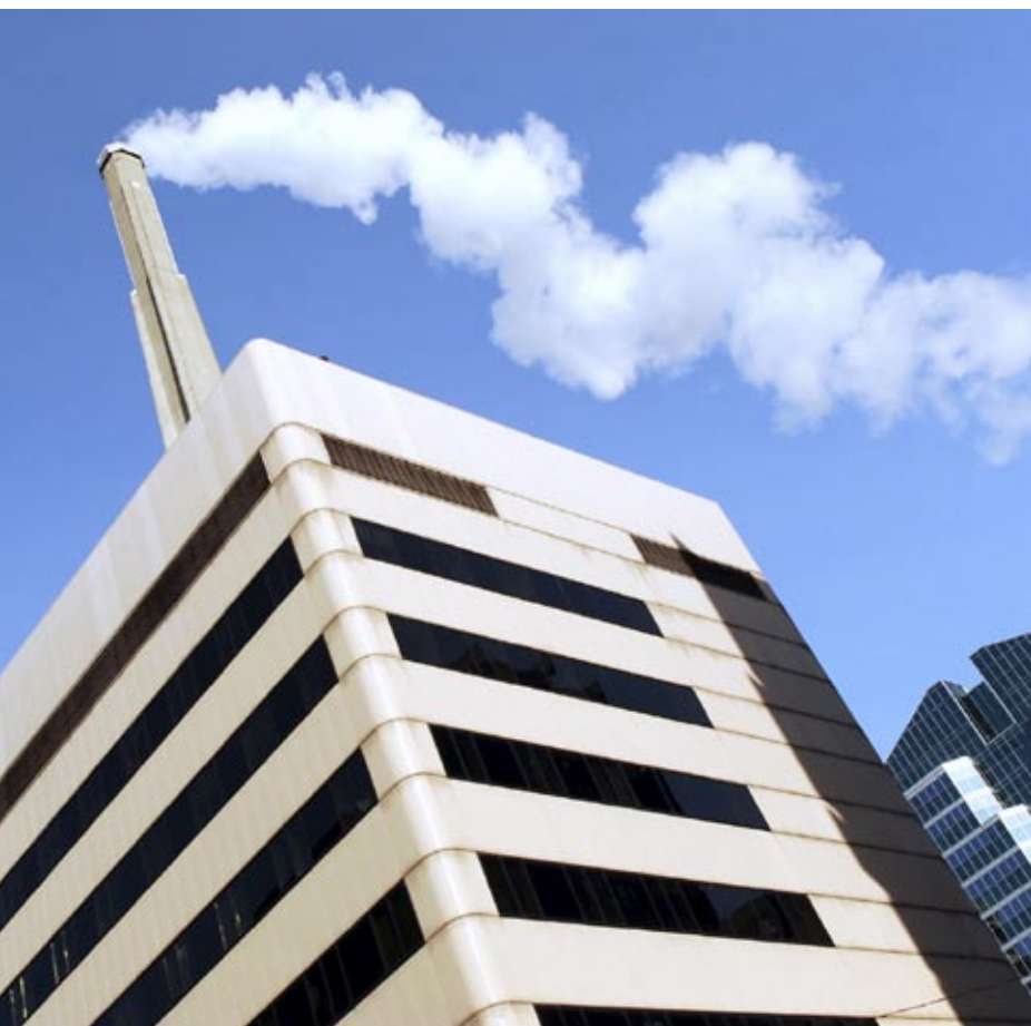
Health care organisations must take urgent action to reduce their carbon footprint

The report sets out what is being done globally, by the European Union and by the UK government to tackle climate change. It provides recommendations for health professionals. Measure your own carbon footprint; turn appliances off; improve ventilation and insulation; save water; reduce waste; buy fresh local produce; and cut down on meat, dairy products, and saturated fats. Avoid overly processed or packaged foods and bottled water. Use public transport, walk and cycle more, cut unnecessary flying and driving.