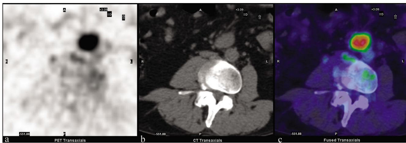
Figure 1 FDG-PET/CT transaxial views of the mesenteric lesion. (A) PET; (B) low-dose CT; (C) PET/CT fusion.

This case report shows that FDG-PET/CT could have an important role in the staging of Castleman's disease and in its evaluation of treatment response.