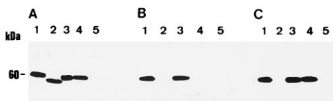
FIG. 1. Genus-specific (A) and species-specific (B and C) identifications of the clinical L. monocytogenes isolates by Western blot analyses with precipitated proteins from 1 ml of supernatants of overnight cultures. Proteins were separated by SDS-PAGE, and the blot assays were performed with anti-whole p60 antibodies (A), anti-PepD antibodies (B), and anti-PepA antibodies (C). Lanes: 1, L. monocytogenes EGD; 2, L. innocua ; 3, L. monocytogenes AB78; 4, L. monocytogenes AB123; 5, E. faecalis .

Initially, all three antisera were used to investigate p60 secretion of the clinical isolates by ELISA. As indicated in Table 1, the anti-whole p60 antiserum reacted efficiently with the supernatants of all strains tested so far, indicating that the clinical isolates do secrete a p60 protein. These findings imply that the analyzed bacteria are indeed Listeria species. Furthermore, the ELISA analyses with the anti-peptide A antibodies also gave clear positive results, indicating the secretion of an L. monocytogenes p60 protein. In contrast, anti-peptide D antibodies did not lead to a positive reaction with the p60 protein of the consistently catalase-negative strain L. monocytogenes AB123. Since this was the first example of an L. monocytogenes p60 protein which could not be recognized by anti-PepD antibodies, we next analyzed the reactivities in more detail by Western blotting. The reason for a lack of an ELISA reaction may have been due to different foldings of this native p60. The proteins of all tested strains found in the supernatant were denatured and separated by SDS-PAGE. As indicated in Fig. 1A, again, the anti-whole p60 antiserum strongly reacted with the 60-kDa protein comprising the p60 protein produced by all