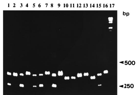
FIG. 4. Size variations of the PCR products obtained from various L. monocytogenes strains belonging to the same phenotype by using the primer combination MonoA-MonoB. PCR products were separated in a 5% acrylamide gel and were stained with ethidium bromide. Lanes: 1, strain VD 8200 serovar 4c; 2, NV 7609 serovar 4c; 3, VD 7065 serovar 4c; 4, NV 4755 serovar 4a; 5, NV 4702 serovar 4a; 6, NV 4700 serovar 4a; 7, SLCC 2374 serovar 4a; 8, SLCC 2375 serovar 4b; 9, LL 185 serovar 4b; 10, LL 184 serovar 4b; 11, LL 147 serovar 4b; 12, LL 142 serovar 4b; 13, SLCC 2371 serovar 1/2a; 14, LL 365 serovar 1/2a; 15, LL 141 serovar 1/2a; 16, LL 93 serovar 1/2a; 17, molecular size standard.

The unequivocal identification of both strains could be simply and rapidly determined by investigating their proteins in crude culture supernatants by ELISA or Western blotting analyses with our L. monocytogenes -specific antibodies which recognize the secreted p60 protein. These recently developed antibodies are raised against synthetic peptides (PepA and PepD) specific for the L. monocytogenes p60 protein and were designed to allow for a more practicable immunological detection of these bacteria from foodstuffs (3, 4). For this purpose, the hydrophilic and highly immunogenic p60 protein, which