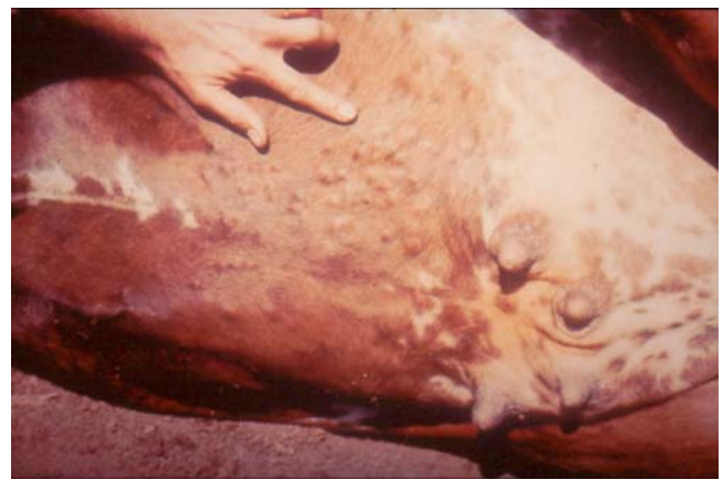
Figure 3. Intradermal Nodules Containing Adult Onchocerca ochengi on Ventral Hide of a Naturally Infected Cow ( Bos indicus ) in Cameroon. doi:10.1371/journal.pntd.0000217.g003