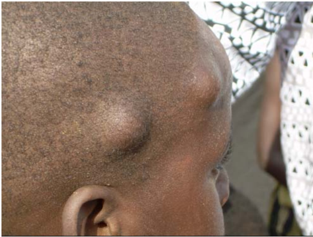
Figure 2. Subcutaneous Nodules on a Child in Ghana. doi:10.1371/journal.pntd.0000217.g002