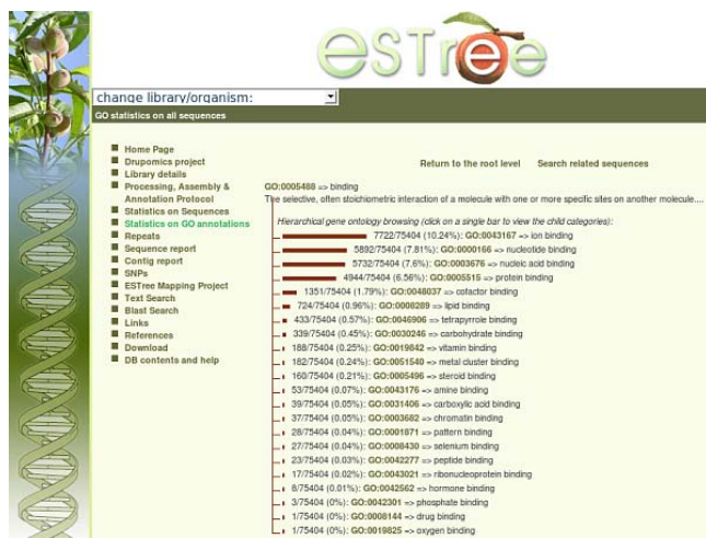
Figure 2 GO Statistics in the ESTree db. An example of a GO Statistics page in the ESTree db. Clicking on bars allows hierarchical ontologies browsing. Sequences matching each GO identifier are retrievable via the “Search related sequences” link.

tions related to specific sequence subsets can be accessed. In total, 21 sequence sets are available, allowing ontologies browsing on sequences from single libraries, as well as on sequences from biologically relevant datasets, made homogeneous with respect to the tissue of origin and/or