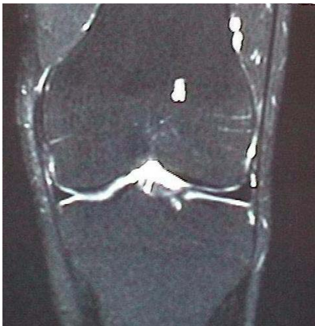
Figure 4 Complete normalization of the MRI signal pattern after 6 months of conservative treatment.