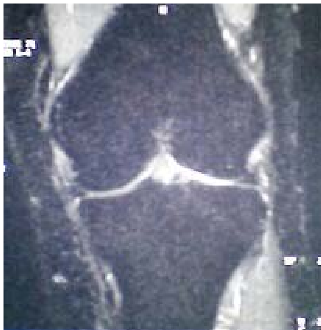
Figure 7 Complete normalization of the MR imaging signal pattern after 10 months.