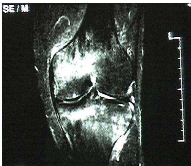
Figure 3 The MR investigation shows a shift of a large BME to the medial and the lateral tibial plateau, and a reduction in the size of the BME in the medial femoral condyle 3 months later.

In 1959 Curtiss and Kincaid [13] reported three cases of young women who developed transient demineralization of the hip during the third trimester of pregnancy. Wilson