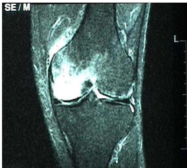
Figure 2 48-year-old man with a large BME in the medial femoral condyle not limited to the subchondral bone on the initial T2-weighted MR investigation (STIR).

The severity of effort-induced pain (VAS) was reduced from 7.5 (2.0–10.0) at baseline to 5.9 (2.4–7.9) after 3 months and to 0.6 (0–0.9) after the final examination. Pain at rest (VAS) diminished from 3.9 (1.5–7.8) to 2.8 (1.4–6.0) after 3 months and to 0 at the final follow-up. In one patient with BMES in the knee, avascular necrosis of the contralateral hip was evident within 16 months, which is being treated conservatively until the present time. All active patients were able to return to the same level of sports as that prior to commencement of their symptoms.