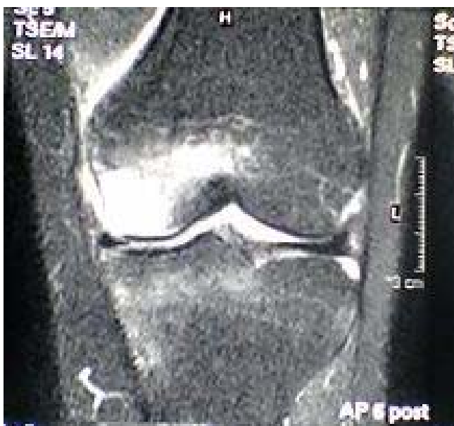
Figure 5 44-year-old woman with a extensive BME in the medial femoral condyle which is not limited to the subchondral area on the T2-weighted MR investigation (STIR).