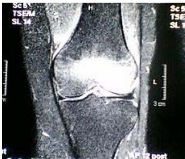
Figure 6 The MR image shows a shift of the large BME to the lateral femoral condyle, reduction in the size of the BME in the medial femoral condyle, and remission at the medial tibial condyle 4 months later.