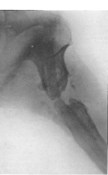
Fig. 6.—Illustrating fracture of peg graft in old fracture of humerus. These cases should be treated by shortening and inlay grafts or the step operation.