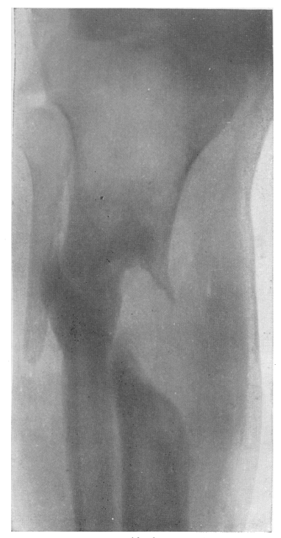
Fig. 5.—Union of fibula and tibia. Note thickening of fibula, the result of weight bearing. Good functional result.