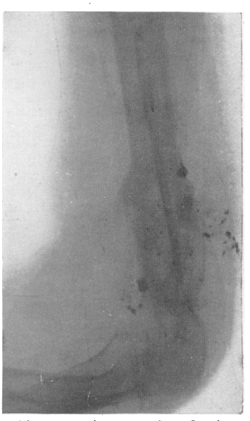
Fig. 4.—After operation. The introduction of a peg graft four months after healing was followed by lighting up of latent sepsis in the old wound. The graft survived, firm union followed, with full movements at the elbow-joint.