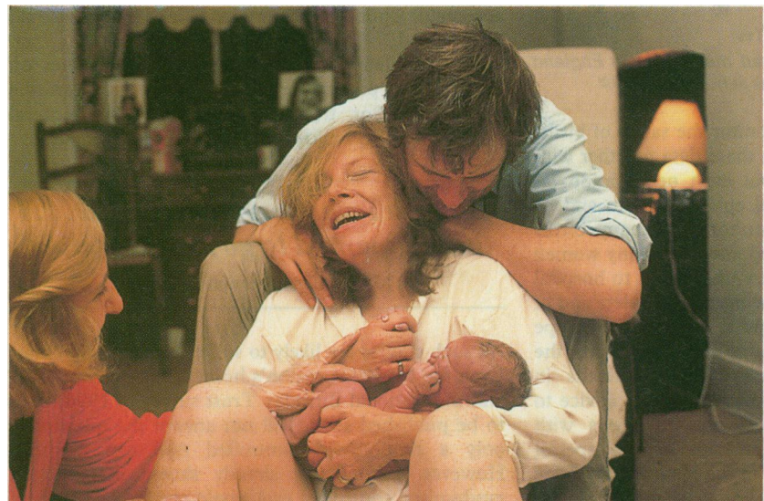
Those who are keen to give birth at home tend to believe that it will be a positive experience for them and their family