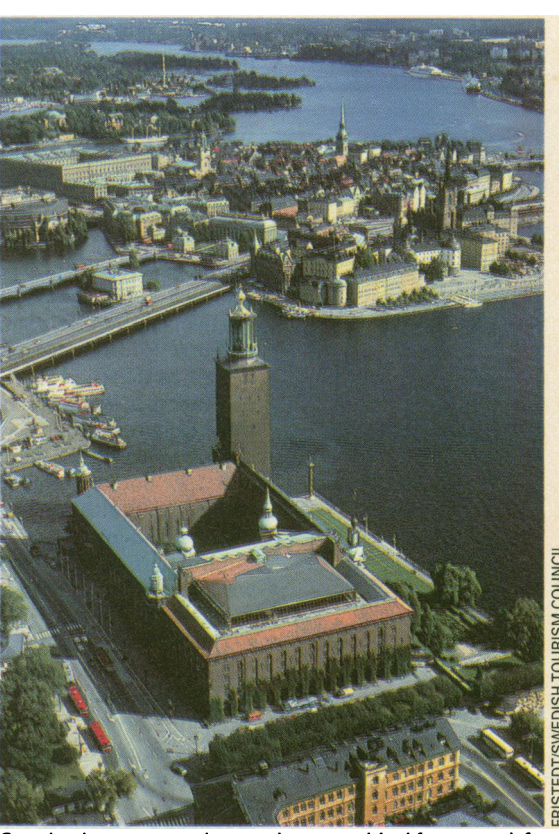
Sweden has managed to produce an ethical framework for making hard decisions about health care provision because there is broad political support for the exercise

A speech by the former Secretary of State for Health that set out the government's views on this issue was noteworthy for the absence of any attempt to provide ethical principles to guide these many decision makers, or even to recognise that such principles might be needed.8 Furthermore, the Health of the Nation