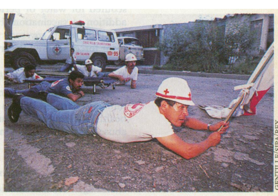
Aid workers are at risk of being caught in crossfire

Several strategies were used to overcome these difficulties.