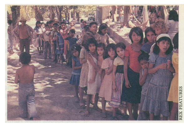
Both sides agreed to stop the war for three days each year to allow children to be vaccinated

Aid agencies and individual medical workers realised the gravity of both the indirect health effects of system-