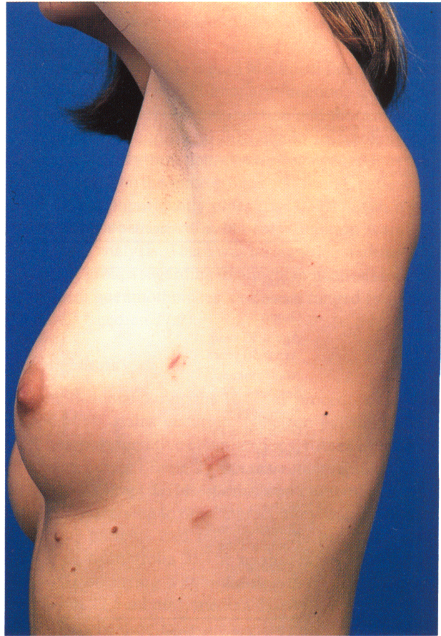
Figure 2 Cosmetic result after VAT in a 19-year-old female patient.